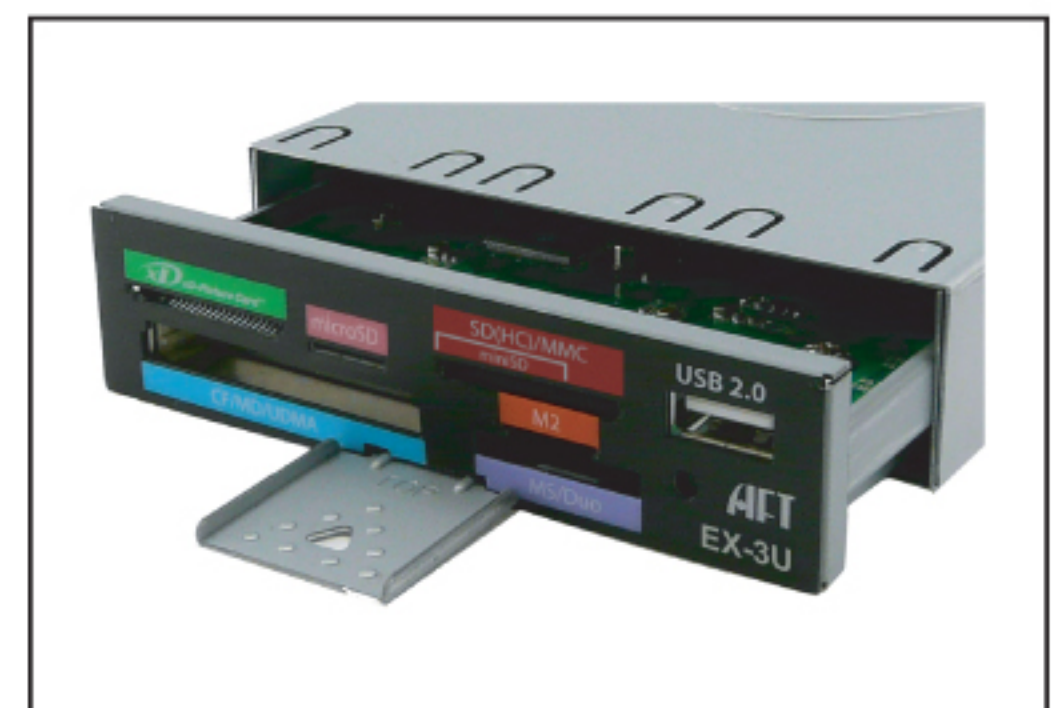
Service Key to eject Reader Cartridge